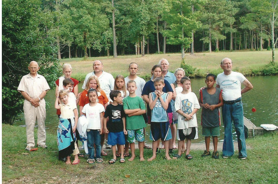
ABOVE: Preparing for Water Baptisms in the lake - 2005 BELOW: Group picture - 1987